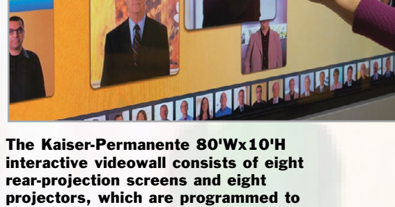
allow the screens to act independently or as a single long mural.