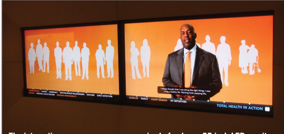
The interactive screen arrays are comprised of a dozen 55-inch LED monitors, with pairs of joined monitors forming six interactive stations. Twelve additional focused-array speakers supply the audio, with two speakers dedicated to each screen.

infrared cameras mounted behind the screens and facing outward to sense touches on the screen, which in turn triggers the appropriate content from the dedicated GestureTek server, located in one of eight racks in the control room that houses all of the space's show control systems and media sources, such as the Marantz PMD371 fivedisc CD player.